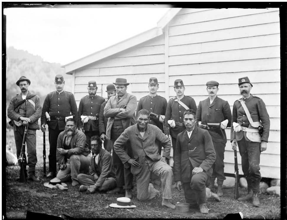
Figure 2. Arrested Māhurehure leaders with police at Rawene, 6 May 1898.

Huihui were located. James Cowan, who accompanied the expedition as correspondent for the Auckland Star , wrote that the troops here narrowly escaped a ‘disastrous ambush’, when two shots were suddenly fired over their heads. 39 However, no further shots were fired and shortly afterwards a messenger reached the troops. He informed them that Hōne Heke Ngāpua, MP for Northern Māori, had arrived at Waimā and called for peace.